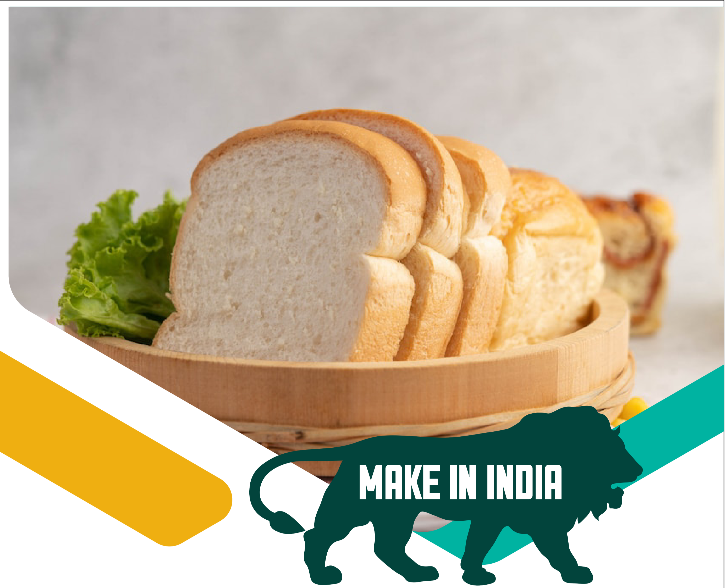
TABLE TOP BREAD SLICER

Upgrade your bakery with our Table Top Bread Slicer, revolutionizing the way you slice and present your bread creations. Experience precision, efficiency, and convenience in one powerful machine, and take your bakery offerings to new heights of excellence.